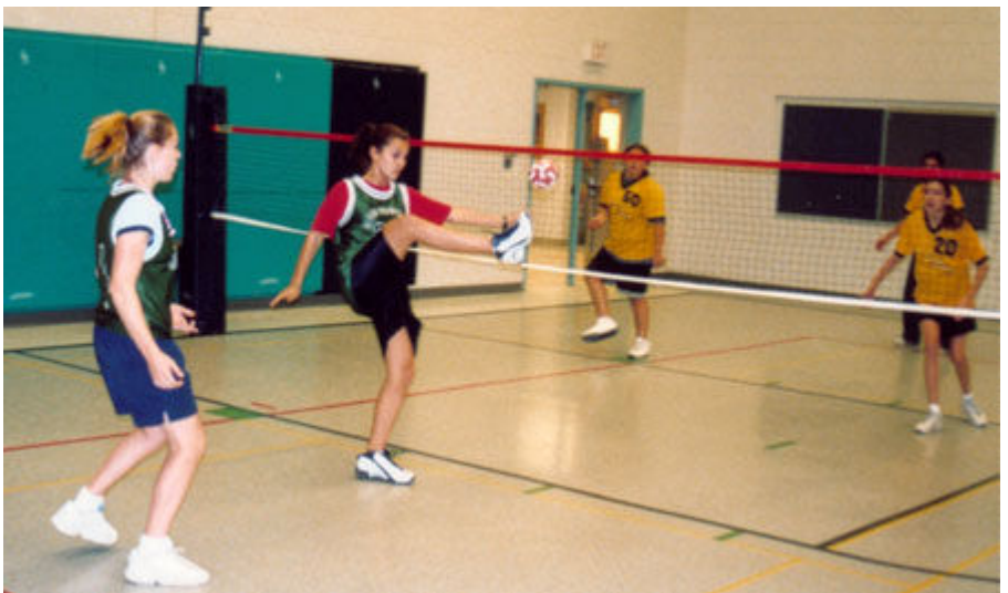
The JHS Girls' teams were just as enthused as the boys in the Oct. tournament