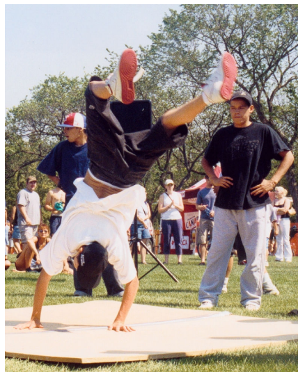
Break dancer doing a back hand spring