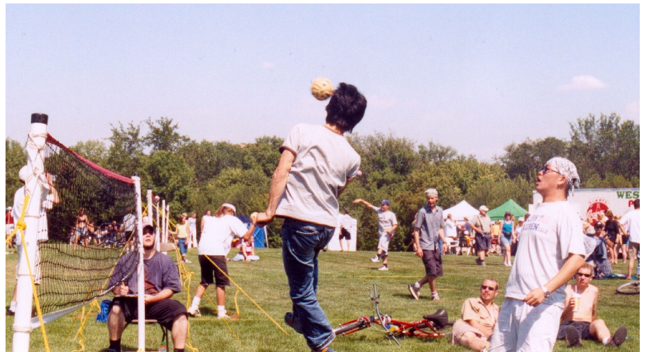
Top: Soccer girls turned Takraw players