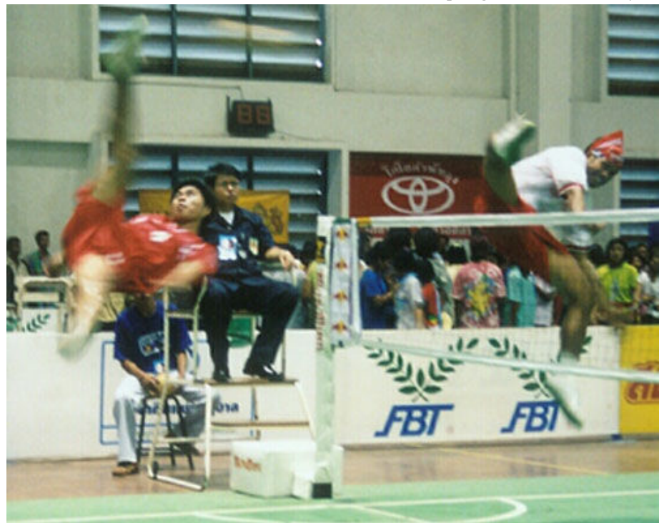
Below: Laos spiking in a match with Malaysia